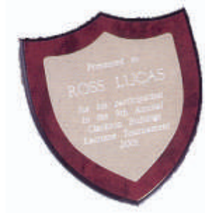
T1-1923 4" x 5" Shield Plaque 1 ... $11.95 ea 12 ... $11.20 ea