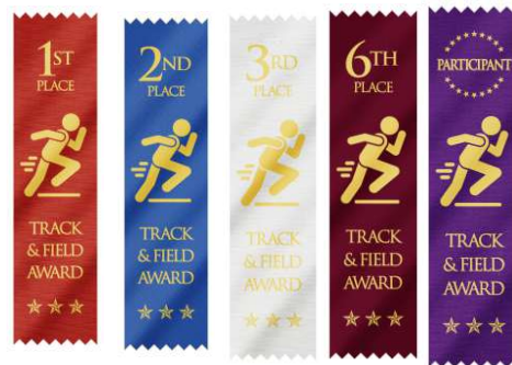
Track and Field

1 - $0.70 ea 100 - $0.57 ea available in 1st - 10th Place, Participant & Stock Ribbons