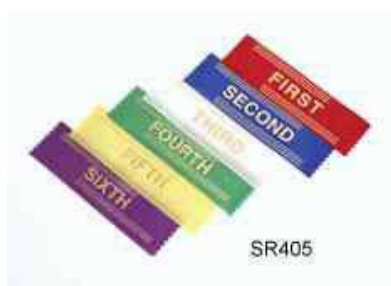
G2-1801 Stock Ribbons

1 - $0.70 ea 100 - $0.57 ea available in 1st - 12th Place & Participant