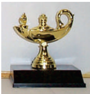
T2-1815 Trophy w/ Figurine 4 1/4" x 3 1/2" black base 1 ... $5.40 ea 10 ... $4.75 ea