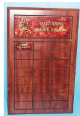
Walnut Laminate Annual Plaques T1-1912A 12" x 12 1/2" $40.00 ea T1-1912B 12" x 15" $46.00 ea T1-1912C 12" x 18" $55.00 ea