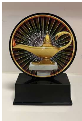
T2-PVS4525 Vibe Academic 4 1/2" $6.50 ea