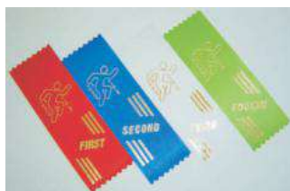
G2-1801T Track Ribbons

1 - $0.70 ea 100 - $0.57 ea available in 1st - 12th Place & Participant