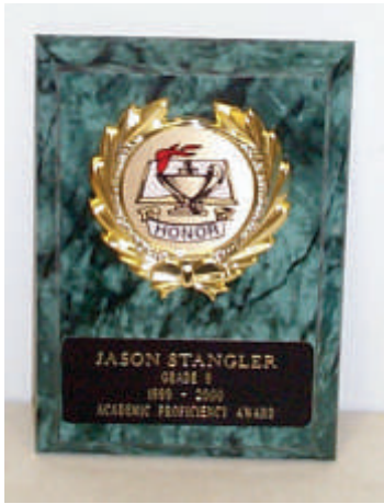
T1-1920 5" x 7"