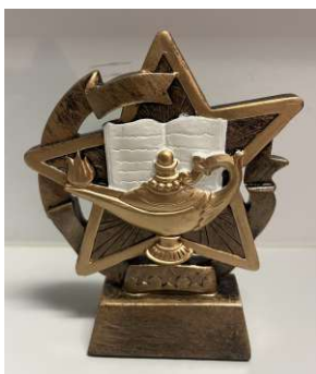
G2-RFGAZ055AG Star Gazer Knowledge 5" $9.95 ea