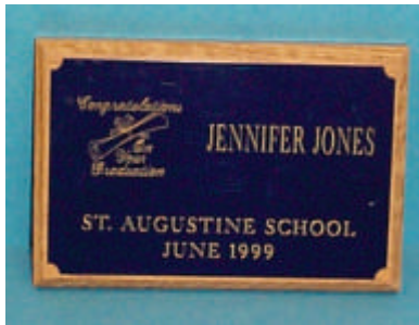
T1-1919 4" x 6"

Plaques T1-1919 4" x 6" available in oak or walnut 1 ... $6.75 ea 12 ... $6.50 ea