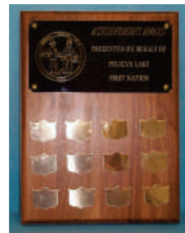
T1-1911A 9" x 12" Solid Walnut Annual Plaque $36.00 ea