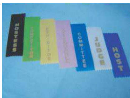
Assorted Stock Ribbons

G2-RI00031-1 1st Place G2-RI00031-2 2nd Place G2-RI00031-3 3rd Place G2-RI00031-6 6th Place G2 RI00033 Participant