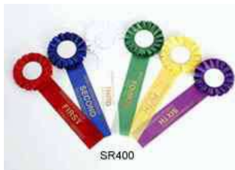
G2-1800 Stock Rosettes

$7.95 ea 1st, 2nd & 3rd available (others by special order)